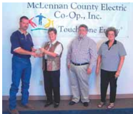
Valley Mills VFD

PLEASE DOWNLOAD AN APPLICATION ONLINE AT mclennanelectric.coop