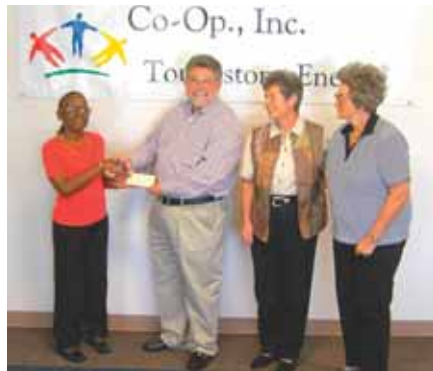
Bell County H.E.L.P. Center