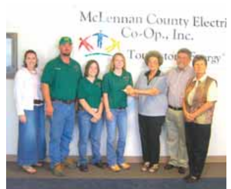
West Shore VFD