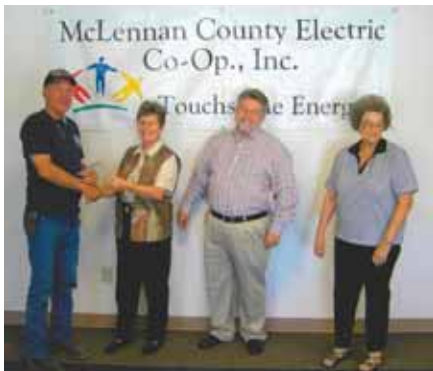
Coryell Senior Citizens Center